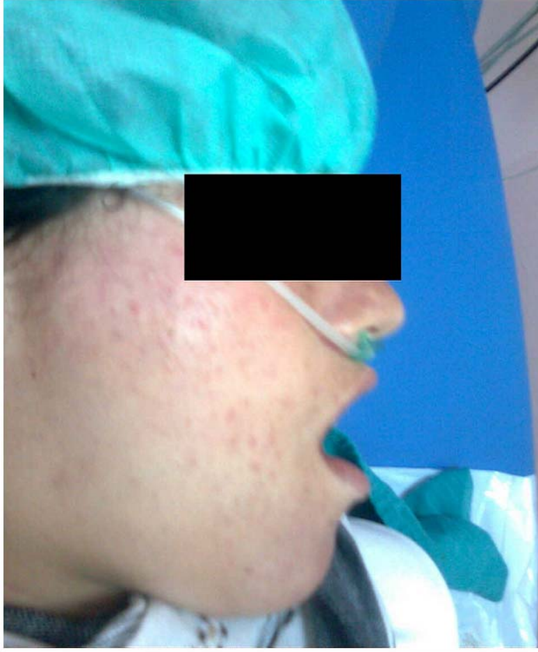
Figure 2 Photography of a profile showing gaping mouth irreducible