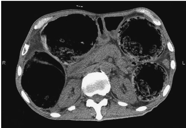
Figure 1. Preoperative CT findings in the CI group. The CT revealed a dilated colon with a diameter of more than 1.5 times the vertebral body's diameter.

vided written informed consent to participate.