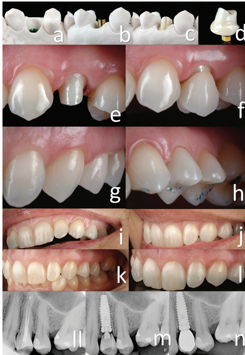
Fig. 3: a) Cast with information transferred that faithfully reproduces the emergence profile. b) Testing the metallic interface on the implant analogue. c) Testing the zirconia abutment on the metallic interface. d) Zirconia abutment cemented on the metallic interface. e) Zirconia abutment test for the first time. f) Zirconia crown test for the first time. g) Harmonic results between the pink and white portions of the smile were achieved. h) Checking the occlusion. i, j, k, l) Final result achieved with only three appointments. m, n) Radiographic sequence: initial situation, with the provisional, and with the final restoration.

using a periodontal probe (Hu-Friedy PGF-GFS, Hu-Friedy, Chicago, IL, USA) (5). Intraoral digital radiographs (Schick CDR, Schick Technologies, Long Island City, NY, USA) were also obtained at baseline and 12, 24, and 36 months after implant placement (5). Periapical radiographs were taken perpendicularly to the long axis of the implants following a long-cone parallel technique with an occlusal template to measure the marginal bone level and to calibrate the changes in marginal bone height over time (Fig. 3m, n) (5).