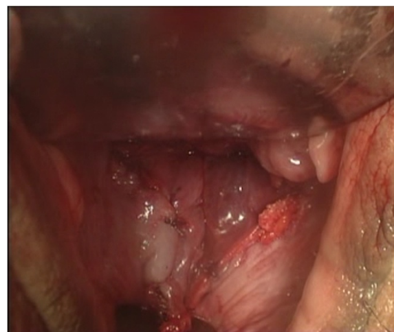
Figure 3 The distal edge of the transplanted peritoneum was sutured to the margin of the vaginal stump intermittently.

Intraoperative and postoperative data were collected prospectively. All patients were asked to fill out the Female Sexual Function Index to evaluate sexual function 6 months after surgery; a score \geq 24 indicates a satisfactory sex life [17]. All patients were followed-up by our team on