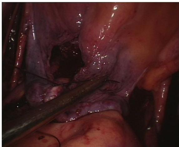
Figure 1 After routine pelvic lymph node removal and radical hysterectomy were performed, the peritoneum covering the roof of the bladder, lateral pelvic side walls and Douglas pouch was preserved.