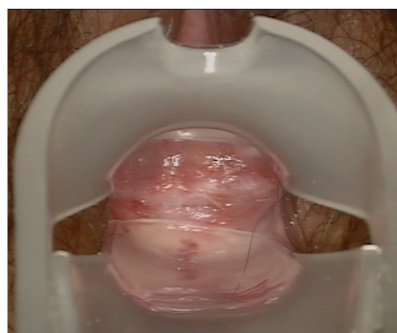
Figure 4 At 6-month follow-up, colposcopy revealed a good vaginal surface covered with squamous epithelium in the neo-vagina of the peritoneal group.

For the psychological rehabilitation of women after radical vaginectomy, creation of a neo-vagina is mandatory, especially in young patients who hope to resume sexual