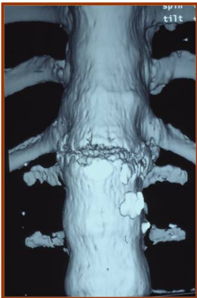
Figure 2 Anteroposterior 3D reconstruction image of the chance type fracture at T12-L1 level.