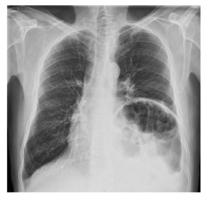
Figure 1 X-ray of the chest (AP view) showing elevated left diaphragmatic dome in the left lower lung zone with visible bowel loops. AP, Anterior-Posterior.