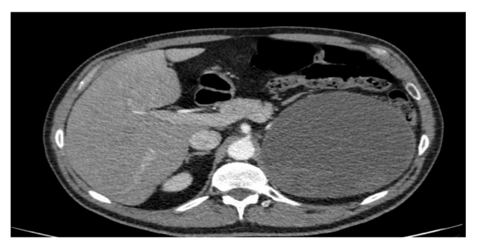
Figure 3 CT scan of the abdomen showing a large well-defined cystic lesion measuring 14.2×13.5×13.1 cm with a thin wall and areas of rim calcification at the left suprarenal region likely suggestive of suprarenal cyst with proteinaceous haemorrhagic contents with eventration of the left diaphragmatic dome. The suprarenal gland was not visualised separately on the left side, while the left lower lung lobe showed evidence of atelectasis of the lower segment. No other focal lung lesion was identified. There were no hilar, mediastinal, axillary or supraclavicular lymphadenopathy, and no pleural or pericardial effusion was noted.

left dome of the diaphragm. The remaining pop ups were taken individually. At the end, the diaphragm was nicely positioned in its down position. Lower lobes were inflated with positive pressure ventilation by the anaesthetist. Haemostasis was ensured.