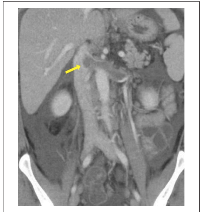
Figure 2. Computed tomography scan of abdomen/pelvis with contrast. Left renal vein thrombus with total luminal occlusion and extension into the inferior vena cava (yellow arrow), along with diffuse lymphadenopathy (periportal, mesenteric, retroperitoneal), hepatomegaly, and splenomegaly.

It is unclear if any specific CLL stage, mutation, or serologic marker predisposes to a higher or lower risk of CLL-associated kidney injury. The Rai and Binet staging systems are typically used to determine prognosis and/or decision to initiate treatment. However, these are based on physical exam and complete blood count, and do not include existing or future risk of kidney function/impairment. Trisomy 12 and del(13q) have been associated with favorable prognoses (eg, progression-free survival, response to treatment, etc), while del(11q), del(17q), CD38, immunoglobulin heavy chain variable region gene mutations, and elevated \beta -2 microglobulin levels have been associated with poor prognoses. 5 However, a single-center case series of 49 patients with biopsy-proven CLL-associated renal injury including nephrotic syndrome showed no predominant mutations, immunophenotypes, or serologic markers. 4 Another multicenter case series of 15