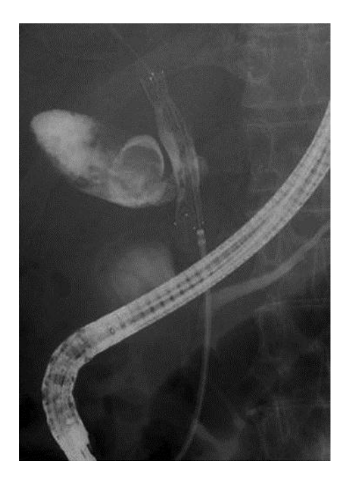
Fig. 2. A fully covered metallic stent was placed in the common bile duct covering the left intrahepatic bile duct.