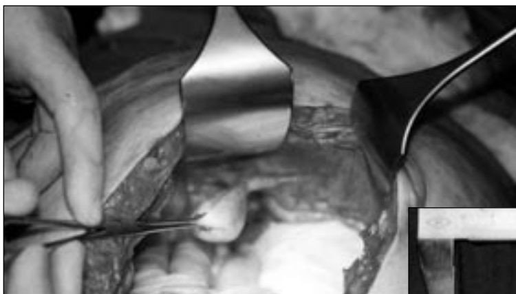
Figure 1. Lipoma of the parietal peritoneum, operative view.

The post-operative course was uneventful and the patient was discharged on the second day after the operation. She remained free of symptoms 12 months later.