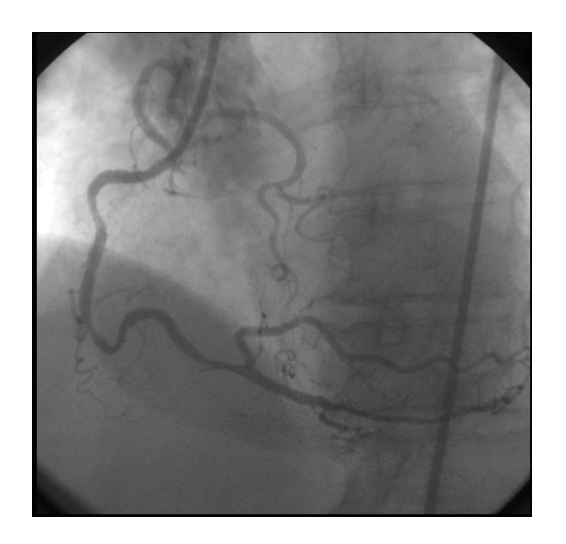
Figure 2: Post stenting coronary angiogram.

coronary artery (LAD) and left circumflex artey (LCX) on the condition of having separate ostiums from the RSV was observed (fig. 1).