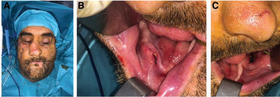
Fig. 1. Preoperative pictures. A, Facial deformities: bilateral palpebral ecchymosis, right deviation of nasal bones, and edema of the lower part of his face. B, Right parasymphyseal open wound. C, Left vestibular open wound.

was performed: it showed a bifocal fracture of the mandible and a nasal bone fracture (Fig. 2).