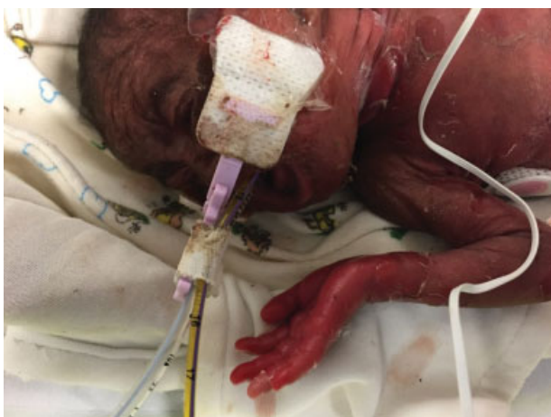
Fig. 2 Face and neck erythroderma with diffuse superficial desquamation.

desquamation, especially on her face with areas of erythema and crusted erosions around her nasal area were noted. Within the subsequent few hours, she was noted to have diffuse erythroderma and superficial desquamation of her face, hands, arms, trunk, and legs (→ Figs. 1–3 ). Clindamycin was initiated to help decrease staphylococcal toxin production. Blood cultures remained sterile but surface cultures from skin fluid, throat, and nares demonstrated methicillin-sensitive Staphylococcus aureus (MSSA). To confirm the diagnosis, sheets of desquamating skin were removed and sent for histologic examination. The examination revealed an intraepidermal split at the level of the stratum granulosum, which is characteristic of SSSS (→ Fig. 4A and 4B ). She