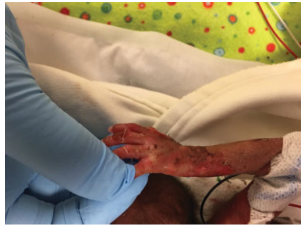
Fig. 3 Generalized erythroderma with diffuse superficial desquamation.

completed a 10-day course of nafcillin and clindamycin for appropriate coverage of MSSA. At the time of completion of antibiotic therapy, only one small area of superficial denuded skin over the extensor knee remained, which healed the following day. The remainder of her skin looked normal. The infant's general clinical condition improved and she was on baseline respiratory support.