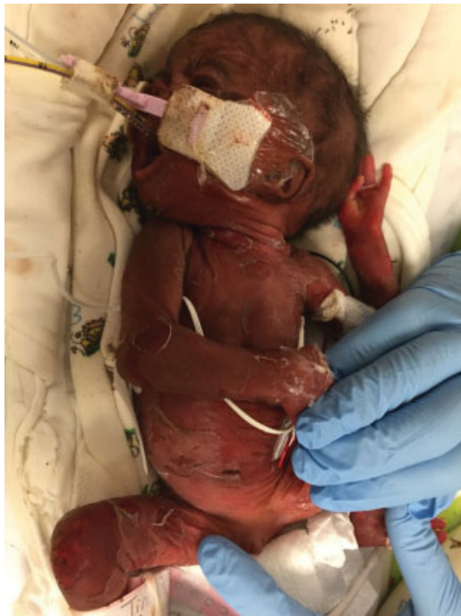
Fig. 1 Upper extremity erythroderma with diffuse superficial desquamation.

desquamation, especially on her face with areas of erythema and crusted erosions around her nasal area were noted. Within the subsequent few hours, she was noted to have diffuse erythroderma and superficial desquamation of her face, hands, arms, trunk, and legs (→ Figs. 1–3 ). Clindamycin was initiated to help decrease staphylococcal toxin production. Blood cultures remained sterile but surface cultures from skin fluid, throat, and nares demonstrated methicillin-sensitive Staphylococcus aureus (MSSA). To confirm the diagnosis, sheets of desquamating skin were removed and sent for histologic examination. The examination revealed an intraepidermal split at the level of the stratum granulosum, which is characteristic of SSSS (→ Fig. 4A and 4B ). She