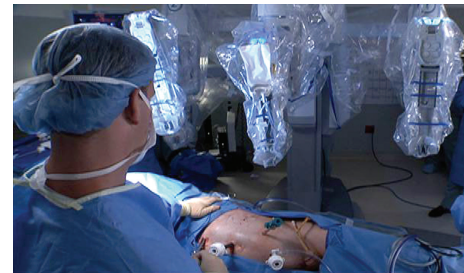
FIGURE 2: Robot docking for RAP. The patient's legs are shifted toward the operating surgeon, and the robot is brought in perpendicular to the room. This creates a 60 degree angle with the patient's spine and helps instrument mobility in the upper quadrants. (Figure adapted from [5] with permissions from the publisher.)

midline is often too far away from the operative target in obese individuals. In obese patients we place the assistant port in the subxiphoid region or the midline (assuming that the ports have been shifted laterally) (Figure 1). The surgeon should insure that the assistant port can reach the operative target without hitting one of the working ports. The port should not be "stacked" directly behind one of the robot ports or the camera port.