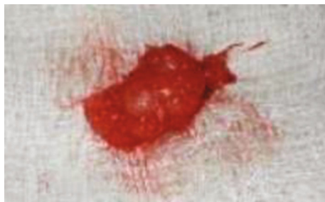
FIGURE 4: Gross excised specimen was suggestive of a firm nodular mass.

channels lined by endothelial cells within the papillary and reticular layers of the lamina propria. The large dilated lymphatics just are filled with lymph and infiltrated with inflammatory cell infiltrates, predominantly lymphocytes, neutrophils, and plasma cells. The histopathological features were in coherence with a diagnosis of lymphangioma (Figure 5). However, the patient was lost for further follow-up.