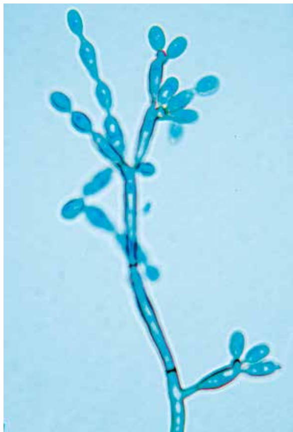
Figure 3. Fonsecaea pedrosoi colony on SGA medium after 14 days of incubation

In the literature, cases of CBM caused by dematiaceous fungi of different families and orders can be found. These