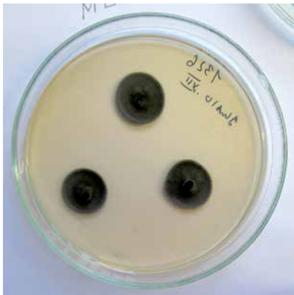
Figure 2. Conidiophores of F. pedrosoi – Cotton Blue Lactophenol staining

cally very similar to F. pedrosoi . Currently, standard diagnosis does not differentiate between these species narrowing the diagnosis to the F. pedrosoi/monophora complex [16].