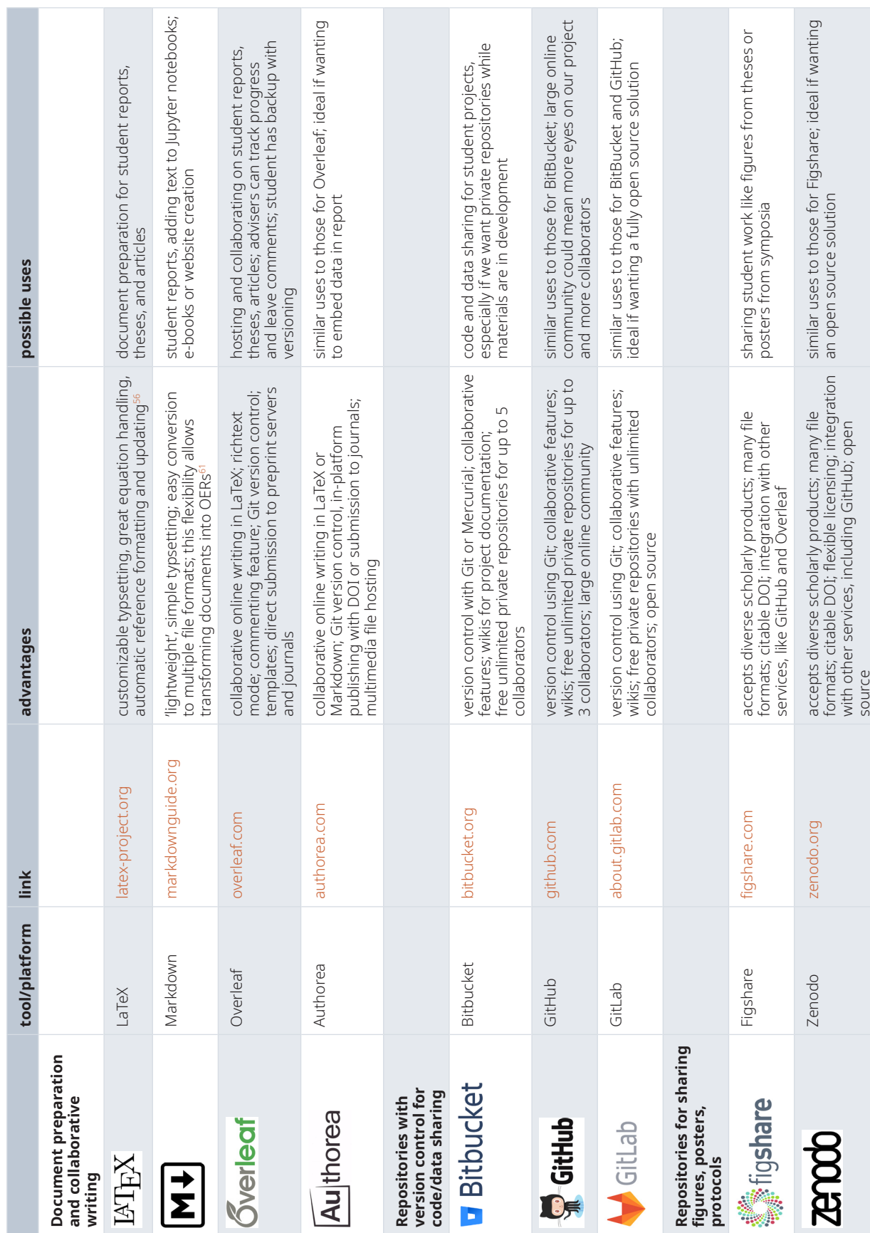
Table 3. Open scholarship tools and platforms useful for teaching and student advising.