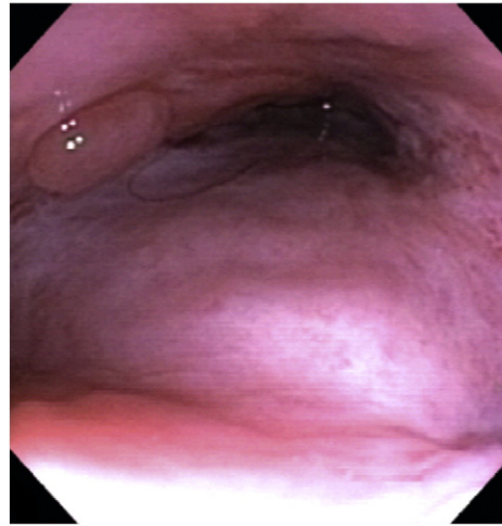
Fig. 3. Vaginoscopy 10 months after graft placement demonstrating normal appearing vaginal mucosa.

an outflow tract. A separate Jackson Pratt drain was then placed into the deep perineal space through the perineum. The perineal wound was closed primarily in layers using 0-Vicryl and 2–0 Vicryl sutures. Final pathology revealed a T4N0M0 grade 1 invasive rectal adenocarcinoma. The anterior radial margin of the perineal and vaginal tissue revealed a small residual focus of rectal carcinoma but no vaginal mucosal or submucosal invasion were present, thus clear surgical margins were achieved.