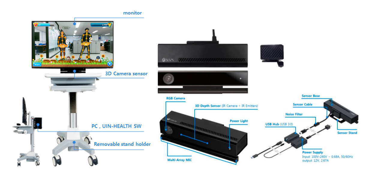
Figure 2. Augmented-reality-based exercise rehabilitation system, UIN-HEALTH<sup>TM</sup>.214.

In this study, UINCARE-HEALTH<sup>TM</sup> was used, which is a product that provides a VR-based exercise rehabilitation program that can interact with participants (UINCARE-82B, UINCARE corp., Korea). The system is shown in Figure 2.