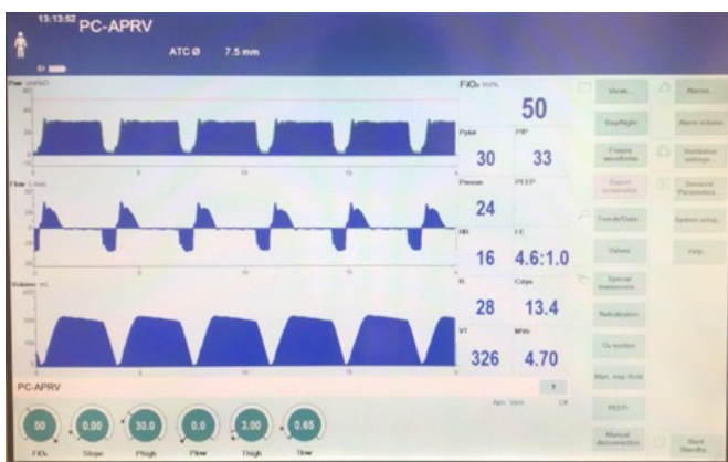
Figure 3 Ventilator wave form on postoperative day 6 (POD6). Representative image from airway pressure release ventilation (APRV) ventilator settings.

When paralysis failed to improve our patient's oxygenation, we transitioned to APRV. This mode of ventilation is timed and cycled continuous positive airway pressure with small time pauses that allow for spontaneous breaths. 1 Theoretically, it promotes better patient-ventilator synchrony, decreases need for sedation, and results in less lung injury. 1,8 We elected against the use of high-frequency oscillatory ventilation in light of several trials showing no improvement in mortality or outcomes. 9,10 In contrast, APRV was recently re-evaluated in a 2017 randomized