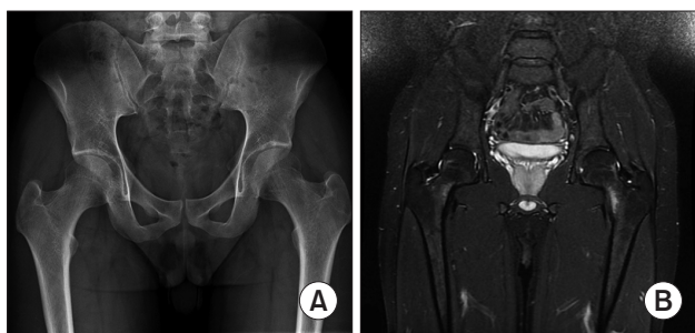
Fig. 1. Imaging findings of a bilateral femoral neck stress fracture, which was treated by conservative treatment in a South Korean male military recruit. (A) An anteroposterior pelvis radiograph showing the femoral necks of both sides without specific findings. (B) A T2-weighted image showing hyperintensity around the inferior aspect of the femoral necks of both sides, and the extents of incomplete compression-type stress fractures were identified as < 50%. Complete union was achieved with conservative treatment.

Concomitant stress fractures were found in 3 patients (25%) in our study, and all lesions involved the proximal tibia. An epidemiology study from the United States reported that 30% of all stress fractures involved multiple