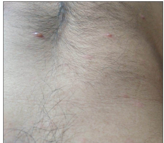
Figure 1: Vesicles on an erythematous base and faint erythematous macules over the chest

Although the cutaneous manifestations are uncommon in COVID-19 infection, it is still evolving as more and more anecdotal case reports and case series are being reported