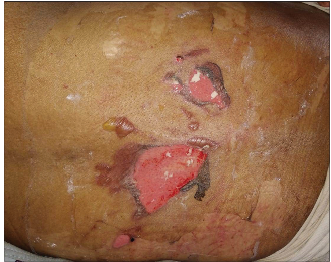
Figure 3: Bullas and erosions with peeling of the skin at the periphery of the erosions

Although rare, cutaneous manifestations may represent an important feature and may occur early in COVID-19, and these lesions may be missed because of the lack of routine dermatology evaluation during the outbreak. Primary-care physicians play an