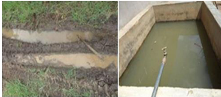
Fig. 5 Tyre marks (left) and water tank around homesteads (right)