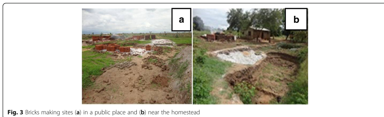
Fig. 3 Bricks making sites (a) in a public place and (b) near the homestead

The study finding indicated that 64.9% of respondents suffered from malaria during the long rainy season (April to June). This is the season when people spend most of