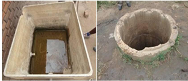
Fig. 4 Water container (left) and an open well (right)

their time in their farms by temporarily shifting from their houses to farm shelters. However, about 78% of respondents reported to take with them mosquito nets to use while they are in their farm shelters to protect themselves from mosquito bites. The relationship between use of mosquito nets and its effectiveness in preventing malaria was not significant at 5% ( p > 0.05 ). This was possibly due to the fact that, the mosquito nets were used only for a very short time (during sleeping), while most of the time they are exposed to mosquito bites. Moreover, the poorly built thatch grasses shelters in use have holes and uncovered windows allowing mosquito entry. Other factors include inconsistency of mosquito net use among those who own nets. It was observed that use of nets was interrupted by temporary, periodic or infrequent conditions, which inhibited net use even among regular net users. These