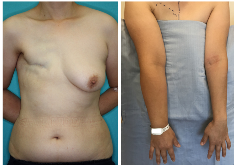
Figure 1. A 46-year-old woman was diagnosed with an International Society of Lymphology stage 2B lymphedema of the right upper extremity after undergoing mastectomy, ALND, and preoperative radiation therapy. ALND, axillary lymph node dissection.

A 46-year-old woman was diagnosed with an International Society of Lymphology (ISL) stage 2B lymphedema of the right upper extremity after undergoing mastectomy, ALND, and preoperative radiation therapy (Figure 1). A DIEP flap was designed in the left hemiabdomen, and a 14 \times 5 cm lymphatic SCIP flap was designed in the Zone 4 region (Figure 2). ICG was injected into multiple sites (designated by the yellow arrows) in the lateral hemiabdomen. The lymph nodes and the corresponding lymphatic vessels were visualized and marked using ICG lymphography (Figure 3, left). The lymphatic SCIP flap was elevated, incorporating the lymph nodes and their corresponding lymphatic vessels (Figure 3, right). The SCIA and the SCIV were anastomosed to the thoracodorsal artery and its accompanying vein, respectively. (Figure 4, left). The flap was de-epithelialized, and the distal end of the flap was sutured to the axillary region, considering the axiality of the lymphatic pathway (Figure 4, right). The breast was reconstructed using the DIEP flap (Figure 5). The estimated volume had decreased by 12.6% at 48 months postoperatively. (Figure 6).