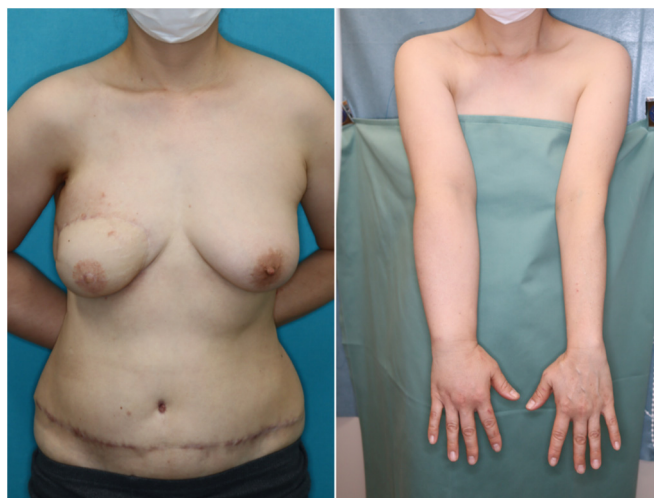
Figure 6. The estimated volume had decreased by 12.6% at 48 months postoperatively.