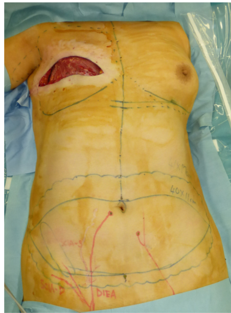
Figure 2. A DIEP flap was designed in the left hemiabdomen, and a 14 × 5 cm lymphatic SCIP flap was designed in the Zone 4 region. DIEP, deep inferior epigastric perforator; SCIP, superficial circumflex iliac artery perforator.