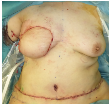
Figure 5. The breast was reconstructed using the DIEP flap. DIEP, deep inferior epigastric perforator.