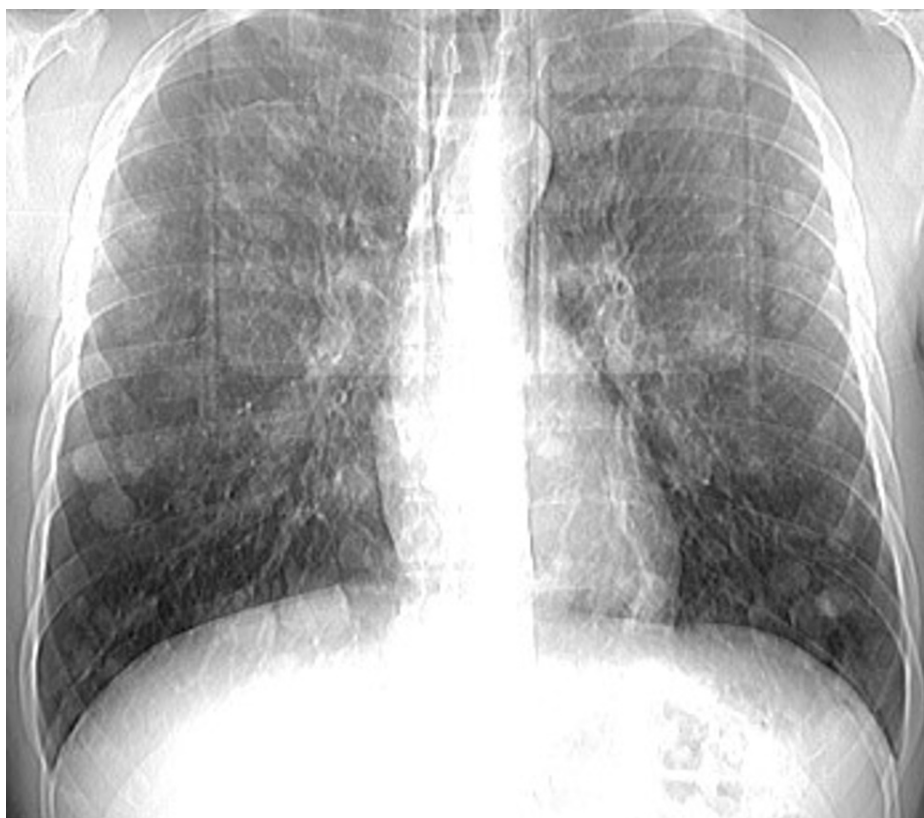
FIGURE 1: Diffuse nodal lesions in all lung fields