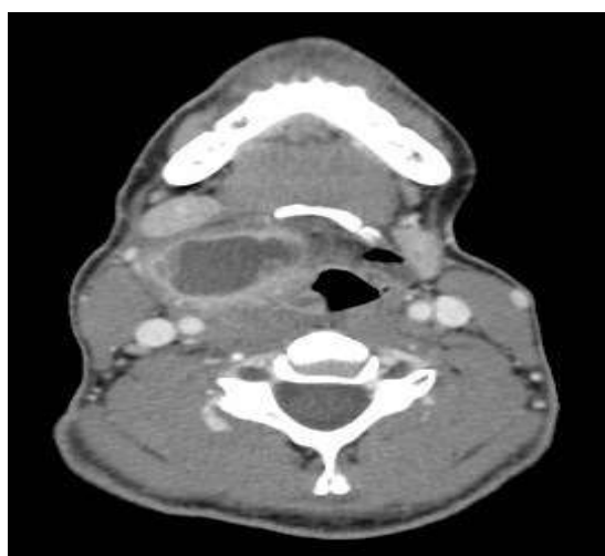
Fig 2. Axial CT scan of the neck during previous hospitalization

Studying the patient's remote pathological history, we found out a previous admission to an ENT Department in 2015 for "suspected right parapharyngeal abscess". During that hospitalization, the patient presented episodes of sinus bradycardia at 37 bpm on average. Therefore, she was subjected to a cardiological examination that revealed asymptomatic sinus bradycardia. Then, she did a neck CT scan with contrast medium, which showed the presence of a mixed right piolaryngocele (Fig.2).