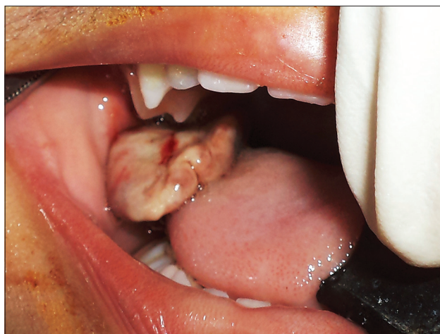
Figure 2: Compressed intra-oral swelling seen after 3 days