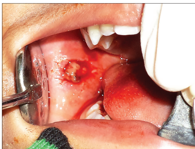
Figure 4: Buccal mucosa after excision of lesion and identification of parotid papilla