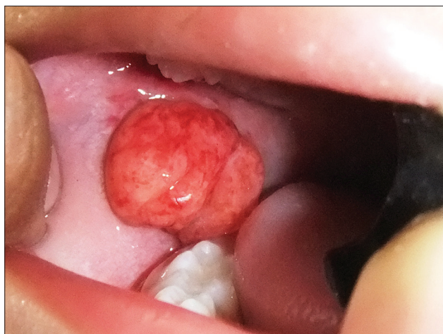
Figure 1: Intra-oral swelling noticed 1 month ago