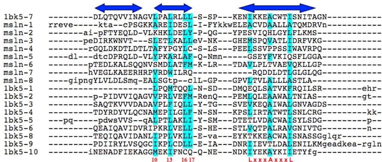
Figure 2 Multiple alignments of the 10 repeats of 1BK5A (lbk5-1 to lbk5-10) and the 8 repeats of mesothelin model (msln-1 to msln-8). The three double-headed arrows at the top of the Figure indicate the boundaries of the three helical regions of the 7th repeat of 1BK5A. The first two form the outer helices and the third the inner helix. The helix boundaries of other repeats do not always agree with those of the 1BK5A 7th repeat. The residues in the 7th repeat of 1BK5A are shown in the next line in uppercase letters. The residues in all other repeats that follow are in upper or lower case letters depending on whether they align with residues of the 7th repeat of 1BK5A or not, respectively. The columns labelled 10, 13, 16 and 17 at the bottom are the key positions in the outer helix that are hydrophobic in many ARM/HEAT repeats [40]. Similarly LxxxAxxxL at the bottom indicates the conserved LEU and ALA positions in the inner helix, x being any residue. The hydrophobic residues (A, V, I, L, M, F, Y, W) in these 7 columns are highlighted.

Other structure prediction servers gave more varied results. Robetta server [24] predicted mesothelin precursor to be made of 4 domains and mesothelin of 2 domains. The program generated 10 models for each of the domains, which were used to build another set of 10 for each of the full chains. All models were made of helices separated by small turns but their overall structures were all different. Most were globular, but a few had the