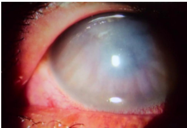
Figure 1 Subepithelial corneal edema, with deep stromal infiltration.

Treatment was suspended due to clinical improvement and only artificial tears were left, with the use of eye protection glasses.