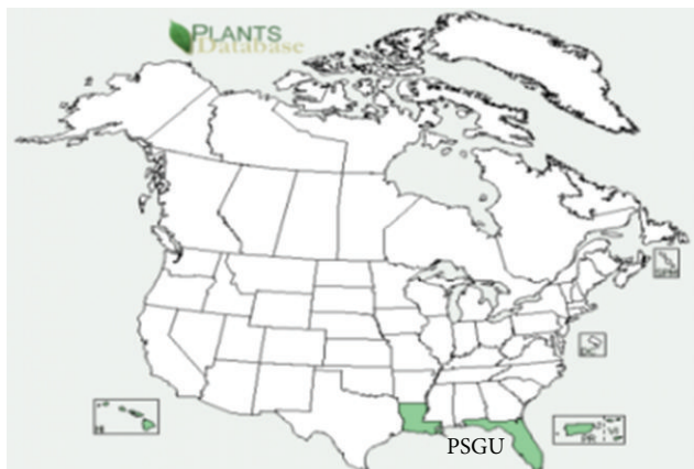
FIGURE 1: USDA plant database. distribution of guava in USA.

The genus Psidium belongs to the family Myrtaceae, which is considered to have originated in tropical South America. Guava crops are grown in tropical and subtropical areas of the world like Asia, Egypt, Hawaii, Florida (Figure 1), Palestine, and others. The genus Psidium comprises approximately 150 species of small trees and shrubs in which only 20 species produce edible fruits and the rest are wild with inferior quality of fruits [11]. The most commonly cultivated species of Psidium is P. guajava L. which is the common guava. Other species are utilized for regulation of vigor, fruit quality improvement and resistance to pest and disease [11]. Guava fruit today is considered minor in terms of commercial world trade, but it is widely grown in the tropics, enriching the diet of hundreds of millions of people in those areas of the world.