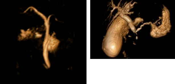
Figure 1: PB images of MRCP. a) Common bile duct joined main pancreatic duct (B-P Type); b) Common bile duct and major pancreatic duct are separated (V Type), narrow-angle between ducts is presented; c) Major pancreatic duct joined common bile duct (P-B Type); d) Common bile duct and major pancreatic duct are separated (V Type); e) Image shows narrow-angle between ducts; B-P Type is presented; f) Image presented right angle between ducts duct (V type)

We did not find any correlation between the age and size of the angle between common bile duct and the major pancreas duct (P = 0.782), (Table 4).