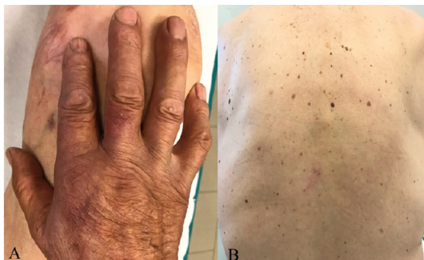
Figure 2. A) Complete resolution of skin lesions with residual dyschromia on dorsum of the right hand and right middle finger B) Complete resolution of skin lesions on the back at 13-month follow-up.