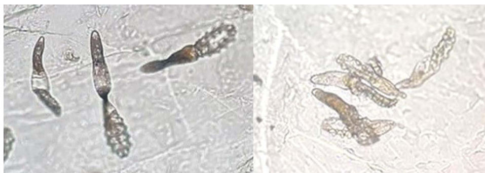
Figure 3 Mites exposed to sweet basil oil shrank, distorted, and deformed after a few minutes of death, while those exposed to ivermectin became smaller and translucent two hours later.