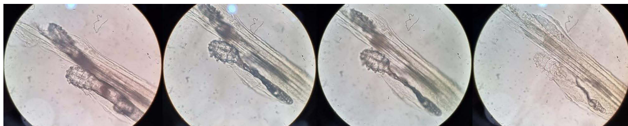
Figure 4 Two mites covered with follicular keratin stopped moving and died within 2 min after exposure to lemongrass oil. The mites shrank, distorted, and became transparent within 30 min after death.

and kill the mites that hide inside (Figure 4). Follicular keratin is a perfect shield for mites, making them difficult to be killed by acaricidal agents. This unique ability could make essential oils an ideal agent against Demodex mites.