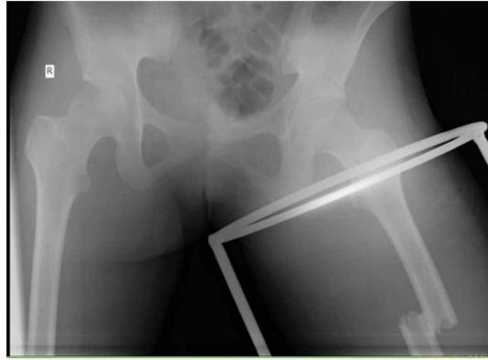
Fig:- 01 A