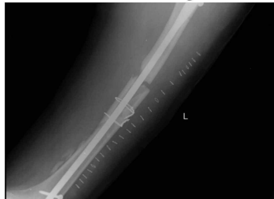
Fig:- 01 D