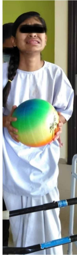
Fig:- 02 B