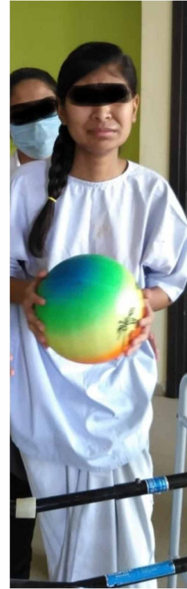
Fig:- 02 C