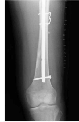
Fig:- 01 B