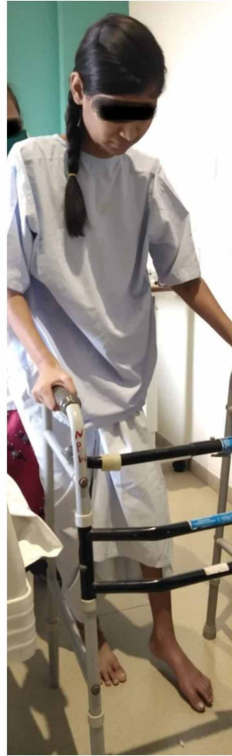
Fig:- 02 A