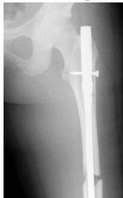
Fig:- 01 C