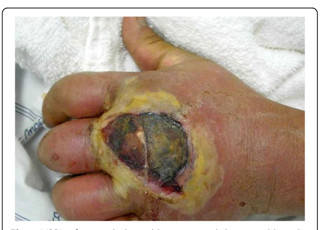
Fig. 1 MRSA infection which would not necessarily be reportable under the bloodstream or invasive infection metrics.

This tracking system contains electronically submitted data from more than 300 laboratories across the United States [6]. For data acquisition years 2005–2008, Klein, et al. [6] reported a stable rate of MRSA related hospitalizations for pneumonia and blood infections; whereas the proportion of cultures with the assumed hospital associated MRSA phenotypes increased. This data appears to contradict the EIP data reported by Kallen, et al. [3] for the same data acquisition dates which showed decreasing MRSA infections, being most pronounced with