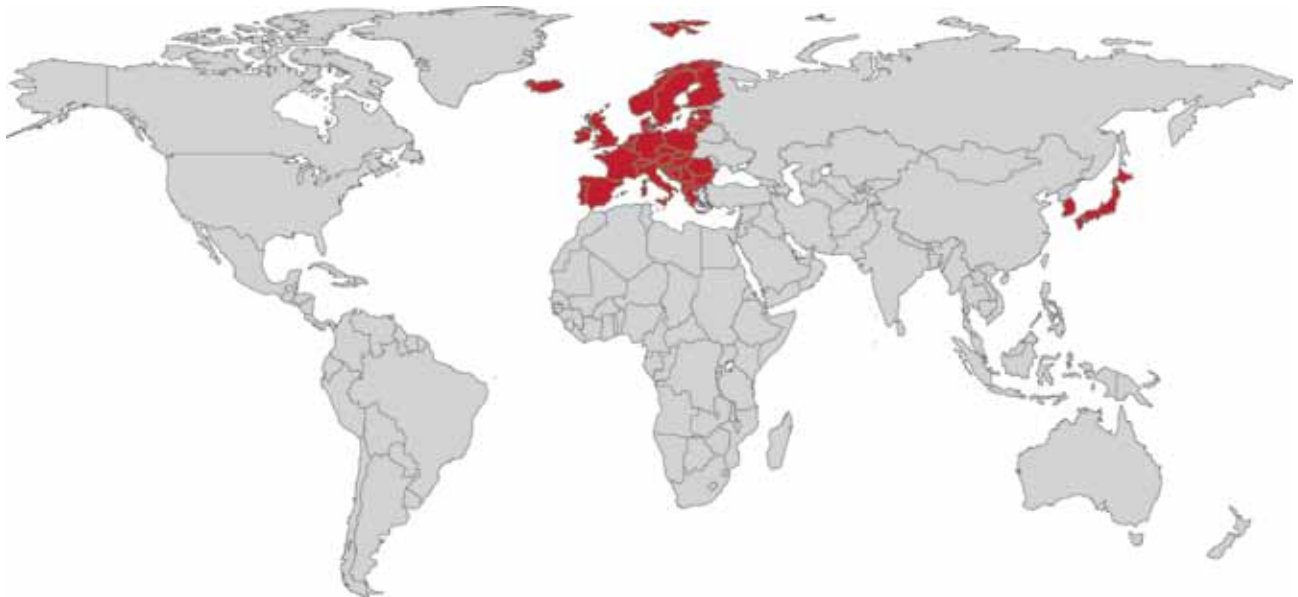
Figure 2. Global progress on the programmatic use of delamanid (DLM) to treat multidrug-resistant tuberculosis. Red shading indicates countries using DLM under program conditions. Gray indicates countries that have not reported using DLM under program conditions.

20% of MDR TB patients worldwide would receive DLM by 2020 (26)—the company has not provided information about how this program will work.