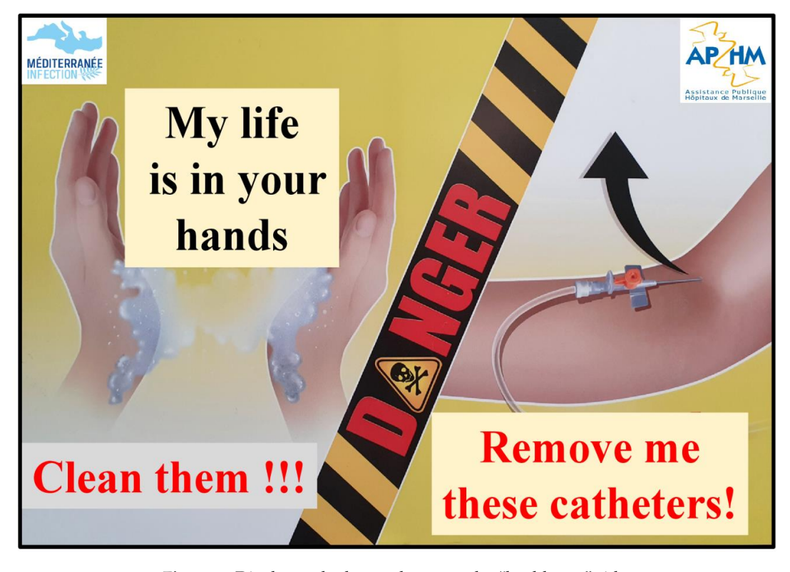
Figure 3. Display on bedroom doors, on the "healthcare" side.