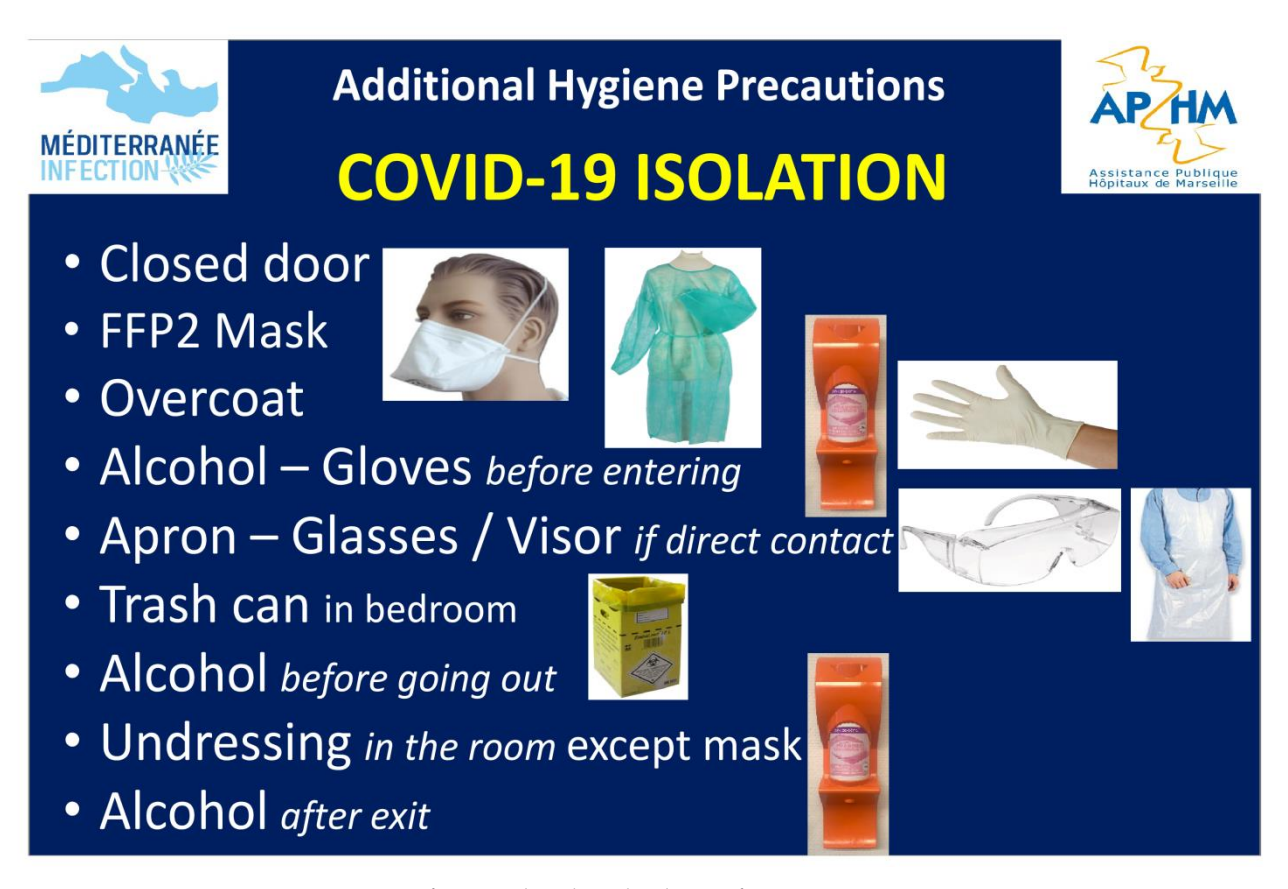
Figure 4. Specific sign placed on the doors of COVID-19 patient rooms.

A specific sign was placed on the doors of COVID-19 patient rooms listing the main protection measures in clinical wards receiving both COVID-19 and non- COVID-19 patients (Figure 4). To cope with the new massive influx of people coming to be tested at the IHU, in addition to the possibility of turning up without an appointment, we organised a queue for patients who had made an appointment via the internet, with a capacity of approximately 700 appointments per day (excluding Saturdays and Sundays), and reaching a capacity of 1000 at the peak of the outbreak. We also deployed a rapid registration system (SI-DEP) that took three minutes per patient. For this, 14 administrative staff members were recruited to speed up patient registration and to communicate with them.