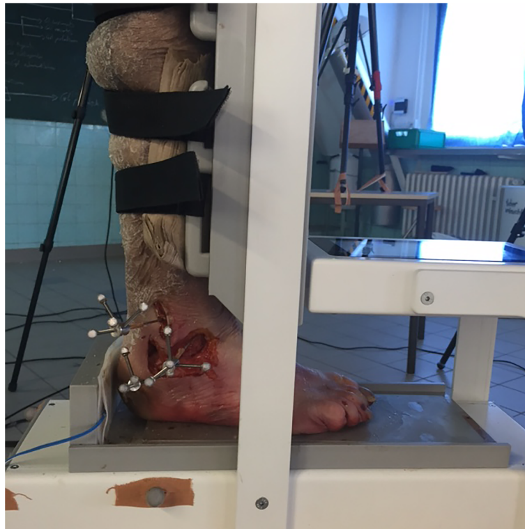
Fig. 2 Photograph, demonstrating the test setup. The leg is fixed to the shin pad of the arthrometer with straps. The footplate induces anterior translation load via the heel pad. Fibula, talus, and calcaneus are equipped with K-wires, which carry 3D Cartesian coordinate systems with spherical reflective markers

analyses, the overall level of significance was defined at p < 0.05 . Descriptive results are reported as median \pm mean deviation around the median. Pearson correlations were calculated between all arthrometer data for all conditions (ligaments intact, ATFL cut, ATFL and CFL cut, ATFL cut and internal brace, ATFL and CFL cut and internal brace, ATFL and CFL and PTFL cut) and the 3D kinematic data (calcaneus vs. fibula).