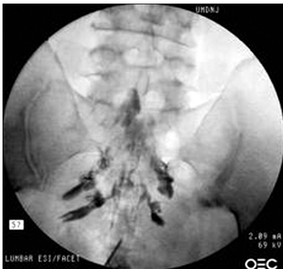
Fig. 1. The contrast agent flow to the left side. The number of cells to which the contrast agent flowed was eight (The result is judged as the flow to the left side because the quantity of the contrast agent that flowed to the left side was greater even though the number of cells to which the contrast agent flowed was the same as the two on the left and the right sides. A total of eight cells were contrasted: L5 middle, S1 middle, S2 left, right, and middle, S3 left, right, and middle.).

To analyze the contrast pattern, the L4, L5, S1, S2, and S3 levels were divided into 15 cells by sectioning each level into the left, right, and middle parts. For the L4 and L5 levels, the lateral contrast flow on the anteroposterior views of the epidurographic images with reference to the medial side of the left or right pedicle was judged as the