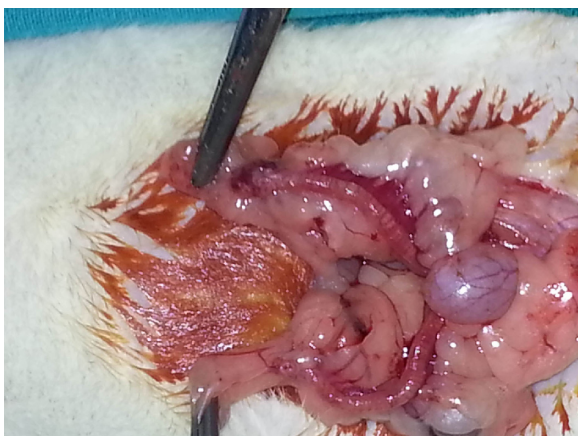
Figure 3 The appearance of the ovaries after honokiol.

Ovarian tissues were fixed in 10% neutral buffered formalin solution for 48 hours and were dehydrated, cleared, and embedded in paraffin, as usual. Serial tissue sections, which were 4\ \mu\text{m} thick, were cut using a microtome (Leica RM2125RTS) and stained with hematoxylin and eosin for general morphological observation. All the sections were examined with a light microscope (Olympus BX43), and the pieces were photographed. At least five microscopic regions were examined to score the specimens semiquantitatively.