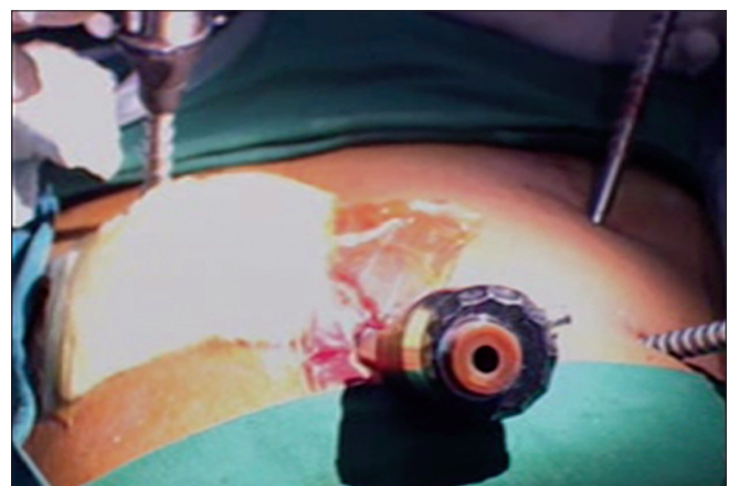
Figure 2: Modified port positions in patient with colostomy