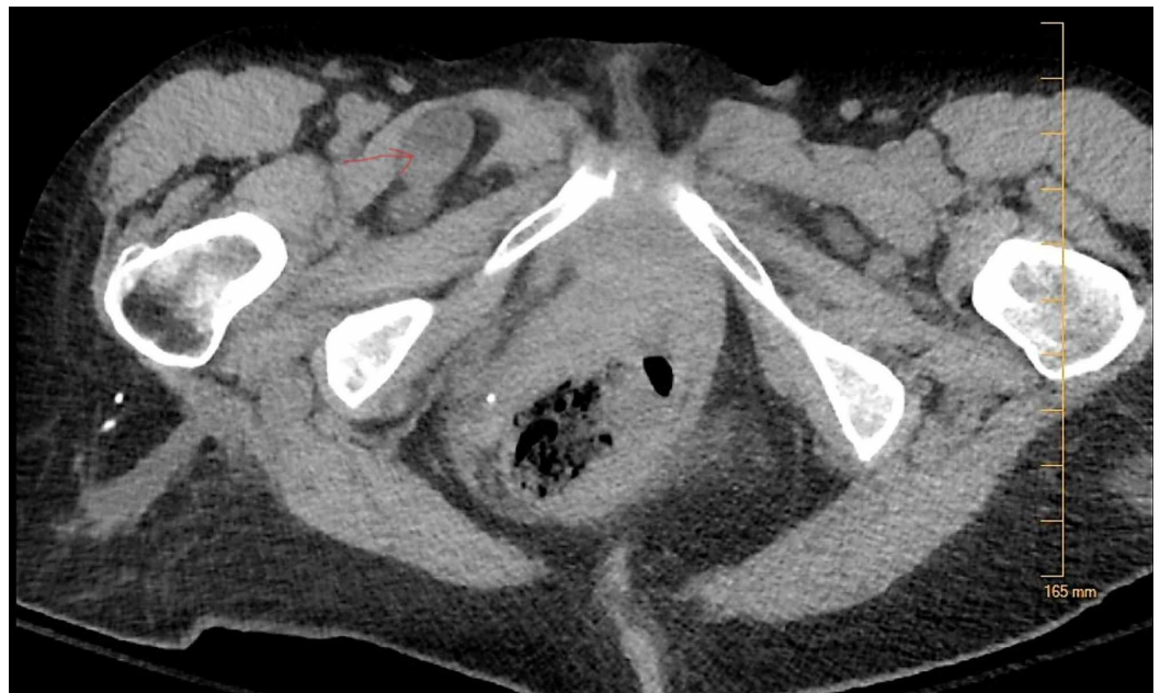
FIGURE 1: CT scan of the abdomen and pelvis showing the Right Obturator Hernia (Axial view).

The patient was a 79-year-old female who presented to the emergency department with an eight-hour history of abdominal pain associated with nausea and vomiting. She also complained of obstipation for the past day as well as right hip pain. Her past medical and surgical history includes right upper lobectomy for adenocarcinoma of the lung in 2008, left nephrectomy for renal cell carcinoma, prior pulmonary embolism, hypertrophic cardiomyopathy and Stage IV chronic kidney disease. Her vital signs on admission showed tachycardia and hypotension. On examination, decreased bowel sounds and mild distended was observed. A computer tomography (CT) scan of the abdomen and pelvis was performed and showed small bowel obstruction with air-fluid levels as well as a right-sided obturator hernia with a loop of small bowel which appeared incarcerated inside (Figures 1, 2). Initial laboratory studies showed mild leukocytosis with a WBC of 10.7, hemoglobin of 15 and hematocrit of 44.3. Creatinine was at a baseline level of 1.8. The patient had a nasogastric (NG) tube placed in the ER with an output of 500 cc of bilious output and was resuscitated with crystalloid and brought to the operating room.