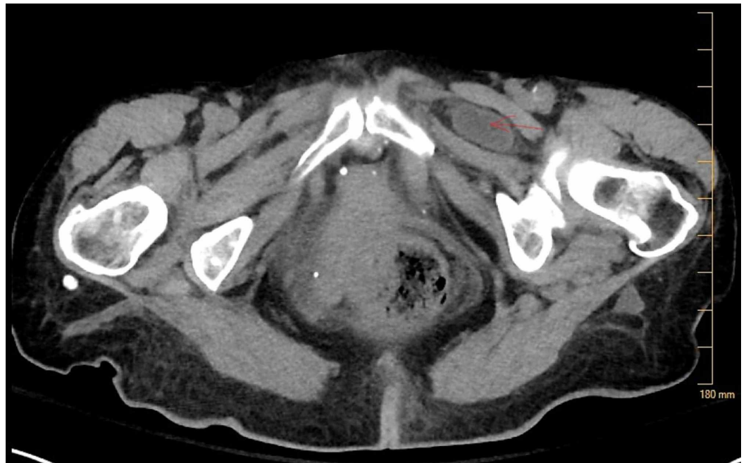
FIGURE 3: CT scan of the abdomen and pelvis showing the Left Obturator Hernia (Axial view).

pain associated with lower abdominal pain while walking. Soon thereafter, the patient began belching but did not develop nausea or vomiting. She underwent a CT scan of the abdomen and pelvis in the ED that demonstrated a left-sided obturator hernia as well as small bowel obstruction (Figures 3, 4). The patient was otherwise hemodynamically stable, and her laboratory studies were within normal limits. The patient was taken for an urgent midline laparotomy through her prior incision and the left obturator hernia was reduced. Intraoperatively, the bowel appeared viable and did not require any resection. The obturator hernia was repaired in a similar manner as the initial surgery with a polypropylene mesh plug. She was extubated the morning after her surgery. Recovery proceeded in a timely fashion as in her previous hospitalization. Her NG tube was removed on post-operative day 2 and she was started on a clear liquid diet. Her diet was advanced, and she remained asymptomatic until discharge.