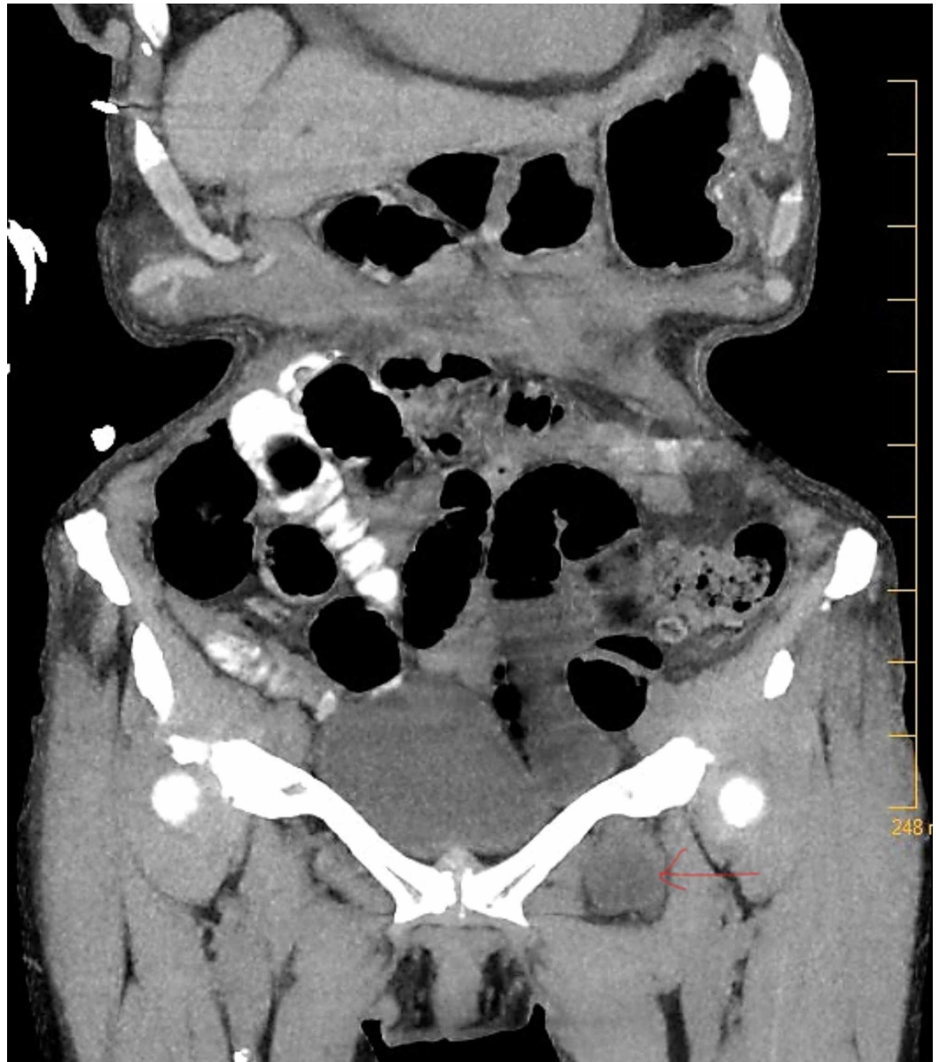
FIGURE 4: CT scan of the abdomen and pelvis showing the Left Obturator Hernia (Coronal view).