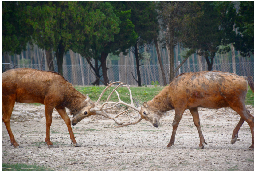
Figure 1: Photo of 2 fighting Père David's deer in Dafeng Milu National Reserves, Jiangsu, China. A red wound was spotted on the body of the deer to the right, and winning such fights generally increases mating chances.

that milu is closer to the genus Cervus [5–9]. However, little is known about the genetic architecture underlying milu's unique phenotypic features and the population dynamics during its recovery from the severe bottleneck. Thus, we constructed a draft genome for the species to facilitate investigation of effects of the severe recent bottleneck and the molecular mechanisms involved in its phenotypic evolution.