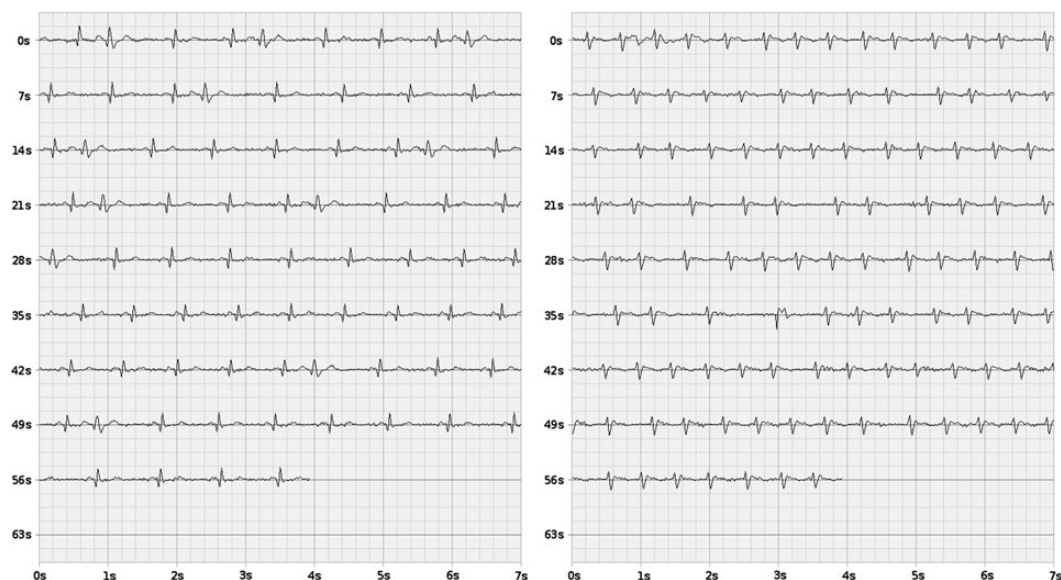
Figure 4 False-positive ECG tracings recorded by the MyDiagnostick. Left: an example of normal sinus rhythm with frequent premature ventricular extra-systoles. Right: an example of atrial flutter with an irregular coupling interval.

both hands for 1 minute and please report the color of the light; is it green or red.' In contrast to other solutions including smartphone and blood pressure devices, 17,18 recording and reliable analysis of the ECG for detection of AF is embedded in the MyDiagnostick. This allows patients to monitor their rhythm anywhere-anytime, without the need for a communication channel, base station, or support from a health care professional. The 100% sensitivity allows the health care provider to only check the red-labelled ECGs to see whether the MyDiagnostick correctly identified AF. The high specificity prevents frequent 'false alarm', minimizing patient's anxiety and workload for the health care professional.