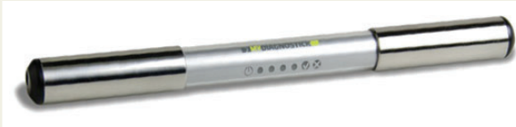
Figure 1 The MyDiagnostick device.

The MyDiagnostick ( www.mydiagnostick.com , MyDiagnostick Medical BV) is intended to discriminate AF from a normal cardiac rhythm (normal sinus rhythm, NSR) based on the ECG. This is achieved by an easy accessible device that can be used by both care providers like general practitioners, nurses, cardiologists and patients. The device has the shape of a stick (length 26 cm, diameter 2 cm) with metallic electrodes at both ends as shown in Figure 1 . The MyDiagnostick does not depend on any infrastructure or communication channels and can be used anytime, anywhere by simply holding the device in both hands for 60 s until the result is revealed. While holding the device, it will flash on the rhythm of the detected heartbeat. After 1 min, the MyDiagnostick either turns green, indicating a normal cardiac rhythm, or red in the case of AF. The MyDiagnostick has no buttons to select functions and switches automatically on when holding the device and will switch off after it has revealed the diagnostic result (red or green light) to the user. Due to the intuitive nature of the MyDiagnostick, diagnosis for AF can be