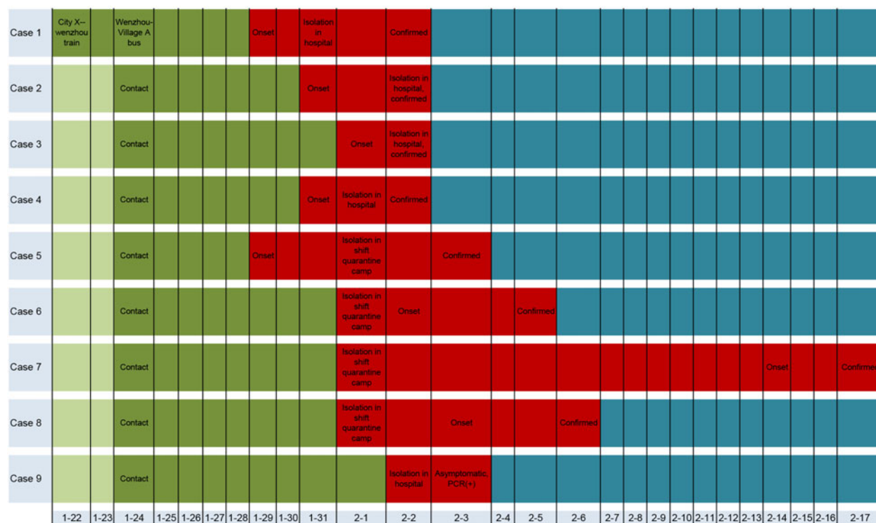
Fig. 1. The time series of a family outbreak of COVID-19 in Wenzhou, China.