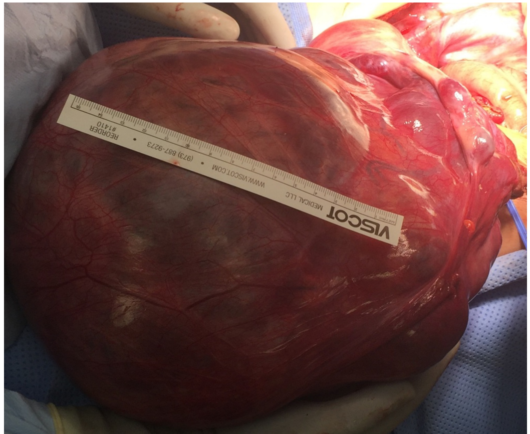
FIGURE 1: Post-operative gross specimen- Large abdominopelvic mass originating from the uterus measuring