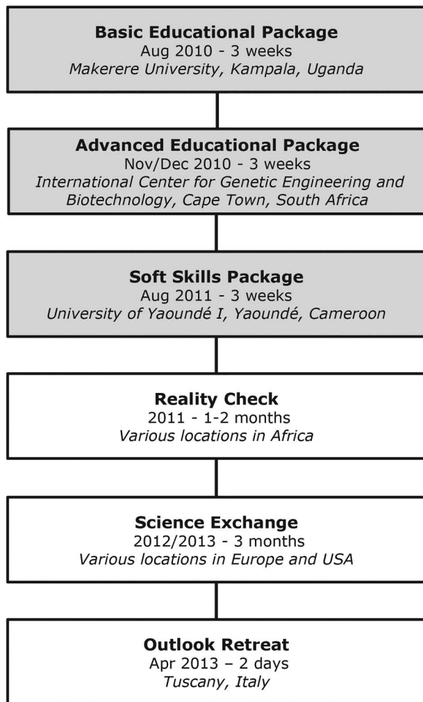
Figure 2 Overview of the various modules of the PRDC programme. PRDC, The Poverty-Related Diseases College.

laboratories, in order to generate research data useful for their PhD projects, or for learning new skills and techniques, and experiencing different working and cultural environments. Owing to unforeseen administrative problems, this module was interrupted for an extensive period, demanding rescheduling of the training activities. Three fellows managed to conduct their training before the interruption, another eight fellows were able to conduct their training after the interruption and six fellows did not accept this opportunity, because they had continued their career in other directions. The overall output of the Science Exchange, despite the long interruption, was considered highly valuable, and turned out to be an important experience for all fellows involved.