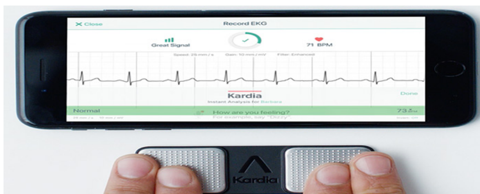
Figure 2 Picture of Kardia device with ECG reading display.

At the time of writing, May 2021, approximately 70 GPs from practices across the Cork and Kerry region in the South of Ireland have been recruited to participate in the study. The target population at the start of the study in January 2020 was the northside of Cork city, but due to the COVID-19 global pandemic recruitment to the study was low and the target population was expanded to include the entire counties of Cork and Kerry to maximise participation rates. A list of GPs from the relevant geographical area was obtained from the Health Service Executive (HSE), Ireland's national body for the provision of health services and all practising GPs in the relevant geographical area were invited to participate in the study. An invitation letter followed by a webinar invited all practising GPs from the Cork and Kerry region to participate in the study. The first invitation was sent to 50 GPs in the northside of Cork city in January 2020 and was subsequently extended to 370 GPs across the Cork/Kerry region who were invited to participate in March 2021. Participating GPs invite all eligible patients aged \geq 65 years, who are attending for a routine appointment to also undergo an AF screening consultation. Examples of routine visits include the