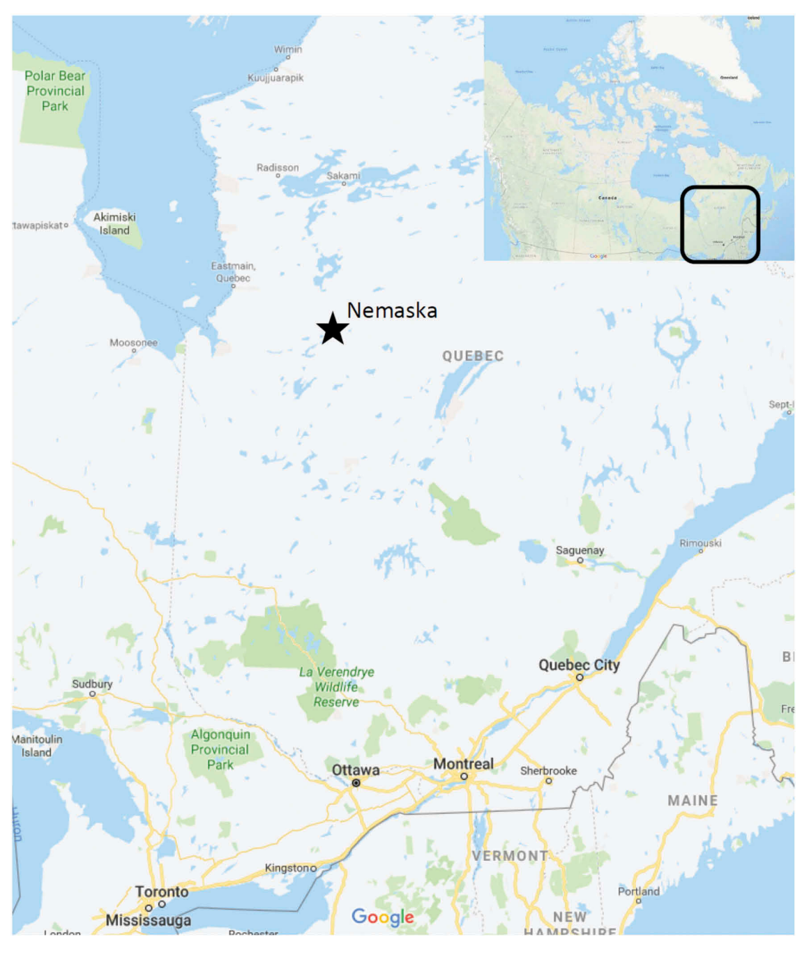
Figure 1. Map identifying the location of Nemaska.

Indigenous communities resulting from historically different colonial interactions with governments [13] and gaps in Indigenous health research with respect to "nutritious food" [22]. Lack of research understanding of cultural meanings attached to health and wellbeing in Eeyou Istchee [15] is allied by a continued need to adopt a community-sensitive approach to Indigenous health research [13,17,23]. Examining perceptions of food and diet in Nemaska will contribute to a broader picture of the range of influences on and