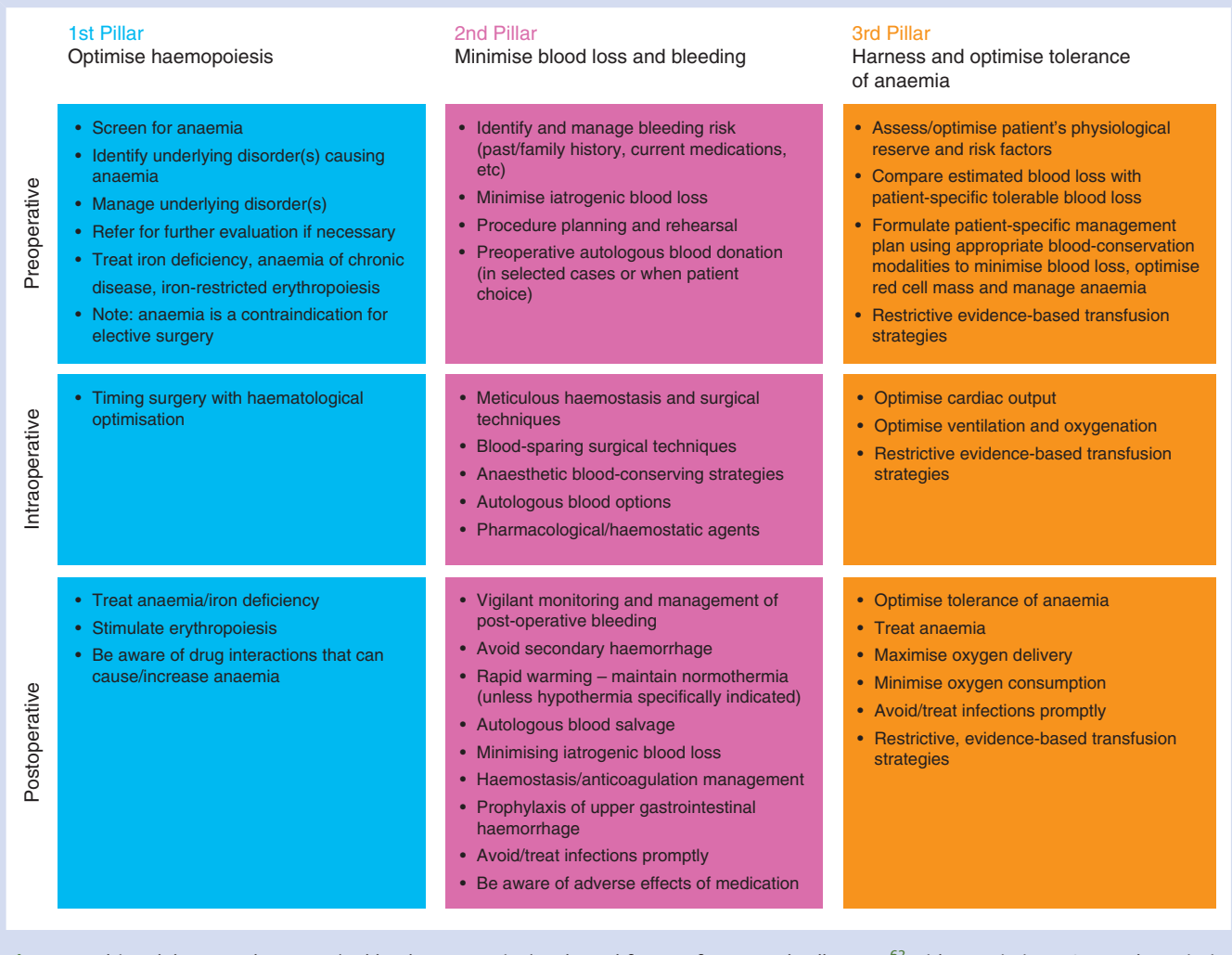
Fig 1 A multimodal approach to PBM (or blood conservation). Adapted from Hofmann and colleagues<sup>62</sup> with permission. ESA, erythropoiesisstimulating agents.