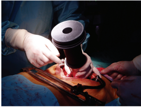
FIGURE 1: The appropriate collimator is placed and beam energy is chosen in order to include the prostate gland and the surrounding soft tissues with a suitable margin of 0.5–1 cm.